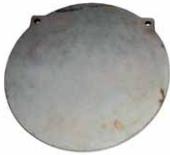
16" Gong Plate