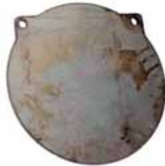
10" Gong Plate

USA made gong plates for years of shooting enjoyment! These plates are cut from certified AR/NM500 steel plate and have been bead blasted and primed to make sure you get the highest quality gongs. Please make sure you follow industry safe practices with the use of any steel target and always wear ear and eye protection. The 12" and 16" models are 1/2" thick plate and the 6, 8, and 10" gongs are 3/8" thick plates. All products are backed by our customer service that makes sure you are satisfied. If you have never shot steel gongs, you don't know the fun you are missing! AR/NM500 Gong Plates - USA Made - Bead Blasted and Primed