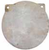
8" Gong Plate