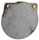
6" Gong Plate