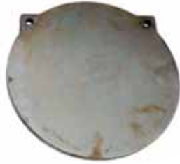
12" Gong Plate